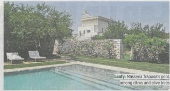
Leafy: Masseria Trapani's pool, among citrus and olive trees