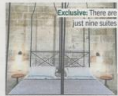
Exclusive: There are just nine suites

From £175 per room per night, trapana.com