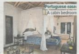
Portuguese ease: A cabin bedroom

From £370 per person per night, including all meals, andbeyond.com