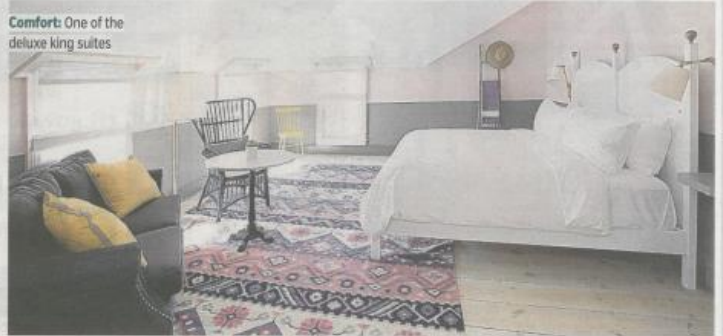
Comfort: One of the deluxe king suites

The bedrooms (and bathrooms) are chic and pared down, with high quality beds and mattresses, linens and toiletries, while the cosy lobby-lounge, the veranda which stretches the length of the building, and other public areas are elegant without being self-conscious – filled with sofas and day-beds, vintage lighting, giant palms and pianos, there's not a cross-