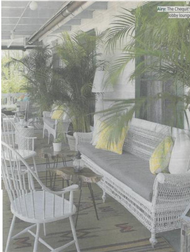
Airy: The Chequit's lobby lounge

stitch cushion or a scratchy eiderdown in sight. The other, often traditional, element of B&Bs the Chequit firmly rejects is an extensive list of rules.