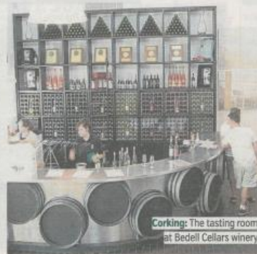
Corking: The tasting room at Bedell Cellars winery

Most of these are open to visitors, who are invited to enjoy picnics on the lawns.