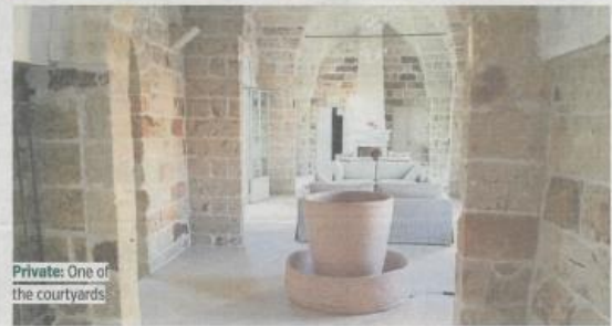
Private: One of the courtyards