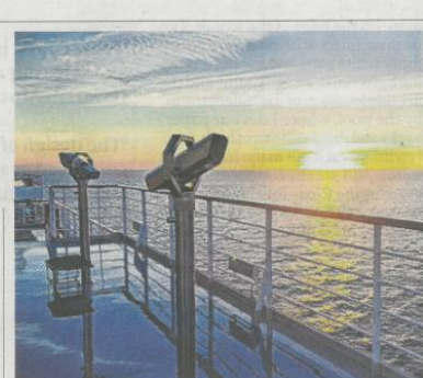
On the horizon: New ships are aiming high THI

in 2016 is Harmony of the Seas, for 5,497 passengers, making its maiden voyage in May (0844 493 3033; royalcaribbean.co.uk). A cruise