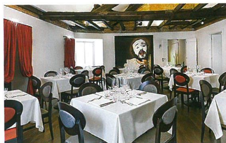
Famous food (above left) Hotel Savoy's Irene; (right) Pavarotti Milano Restaurant Museum

The Pavarotti Milano Restaurant Museum, dedicated to legendary tenor Luciano Pavarotti, opened last June, with seven rooms and a menu featuring some of the star's favourite dishes. Clandestino Milano at the Hotel Maison Moschino restaurant seats 45 and two-Michelin-starred chef Moreno Cedroni creates what he calls "Flower Child Sushi", which replicates the Japanese original, but uses carnaroli rice, Italian extra-virgin olive oil and Burrata cheese in place of wasabi or seaweed.