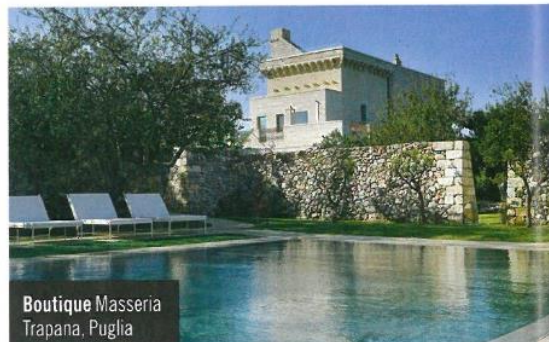
Boutique Masseria Trapani , Puglia

Meanwhile, Starwood Hotels & Resorts announced that Le Méridien will open in Rome,