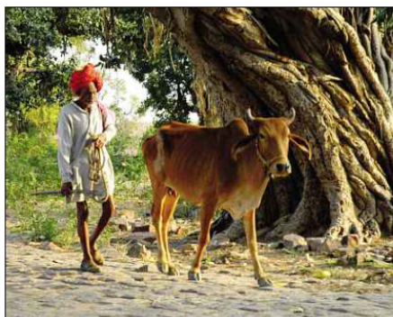
Enter India's "old-time world"

From Delhi, the night train rattles you down to Chittorgarh, an industrial city with an amazing hilltop fort. Its "brilliantly carved" triumphal tower is resplendent with gods, elephants and horses; and there is a wonderfully decorated temple to Vishnu. Next