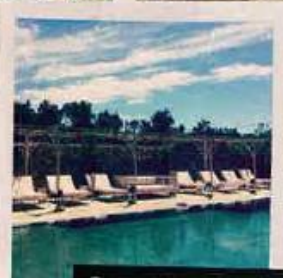
Oonagh at the entrance to the property; and above, relax poolside

enough for peace and tranquillity (there are enough hammocks dotted about the gardens for everyone to have an afternoon snooze) but also small enough that staff remember you like a skinny cappuccino every morning (which I do). Here the pressures of everyday life melt away on the lemon-scented air, you don't even need to choose your evening meal, there's a set menu each night served on the terrace (all preferences catered for, of course) so you get what you're given, just like at home.